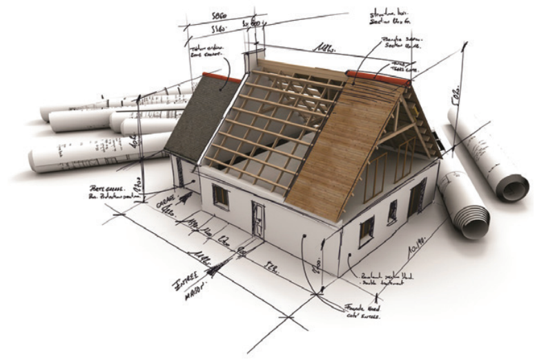
Expert Designs & Consulting