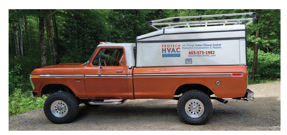
Masterful Service & Installations of Everything Indoor Climate Control.

Whether you have an emergency HVACR service problem, or need a quote for a larger repair or system replacement, or have the need for an expert to consult on any aspect of Indoor Climate Control, you can always reach us at the contact information below.